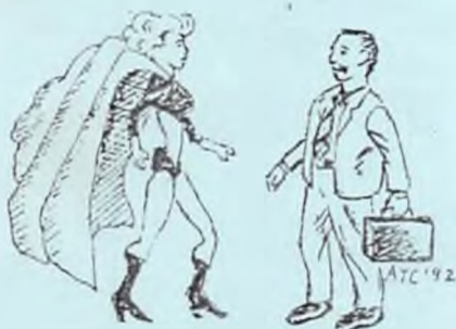
FIRST CON, HVH?

Thursday's winner: #3612 Friday's winner: #1248